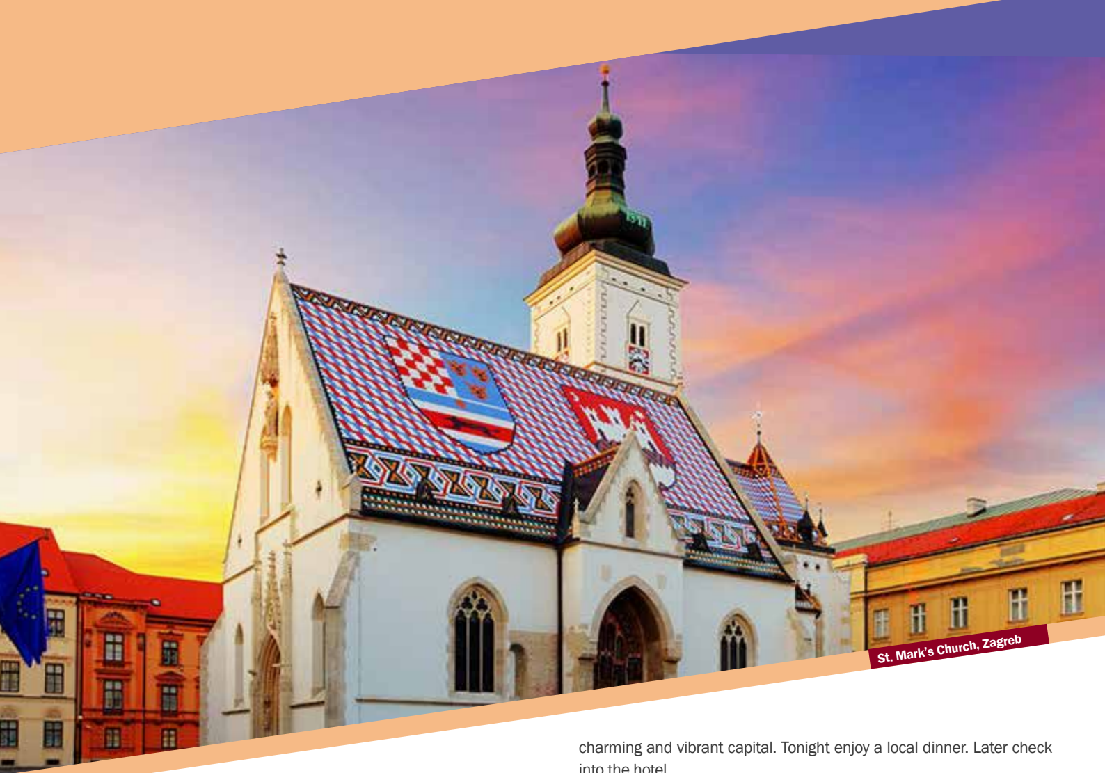
St. Mark's Church, Zagreb

charming and vibrant capital. Tonight enjoy a local dinner. Later check into the hotel.